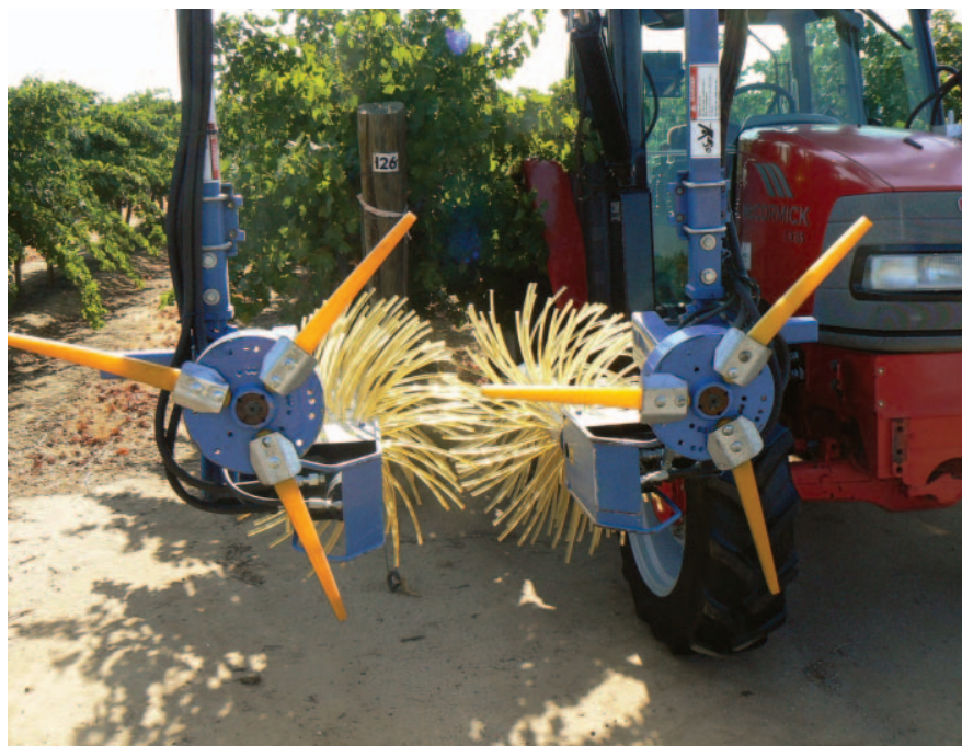
A Korvan Cordon Brush can remove unwanted shoots from vines in early spring.

and Berg said he believes mechanized pruning and canopy management can be done with more uniformity and consistency than hand operations in order to achieve balanced cropping.