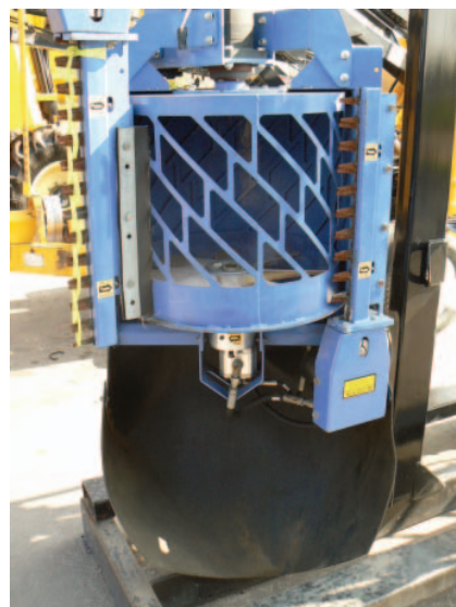
Korvan's de-leafer can remove leaves from the vine fruiting zone.

ing drum that draws in air and leaves that are sheared from the vine with a sickle bar. Berg said not much leaf removal is done mechanically in Central Valley vineyards, so he adapted the de-leafer for the research trials by attaching a bow rod in front of the unit to lift canes up and away from the fruiting zone, thus providing access. The leaf remover is used starting in late spring, after berry set and before veraison, to assist with air circulation and light penetration to the fruiting zone.