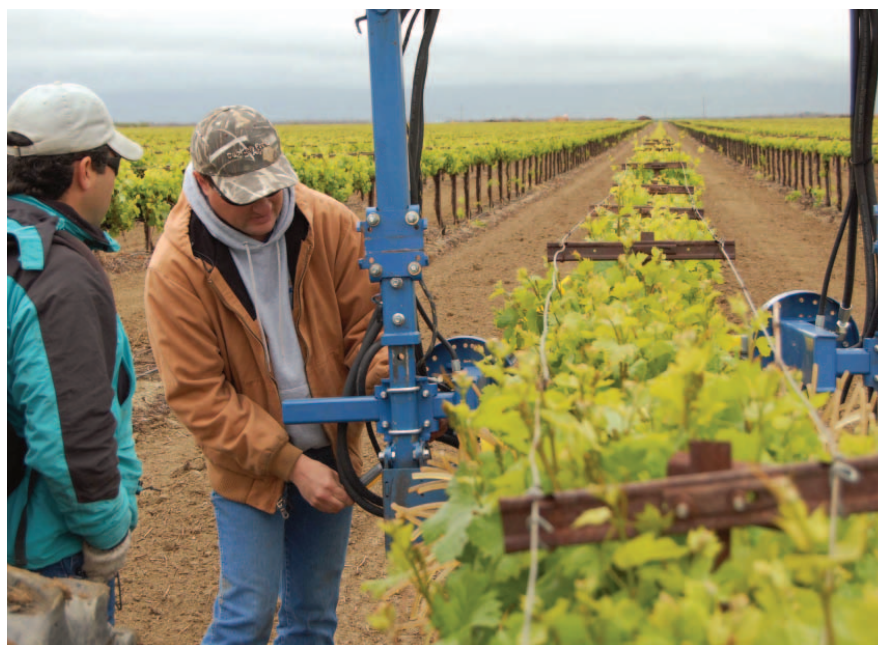
Adjustments were made in the vineyard to the shoot thinning equipment to improve performance.

Both the syrah and the pinot gris vines were dormant-pruned the third week of February, with the hand-pruned vines spur-pruned