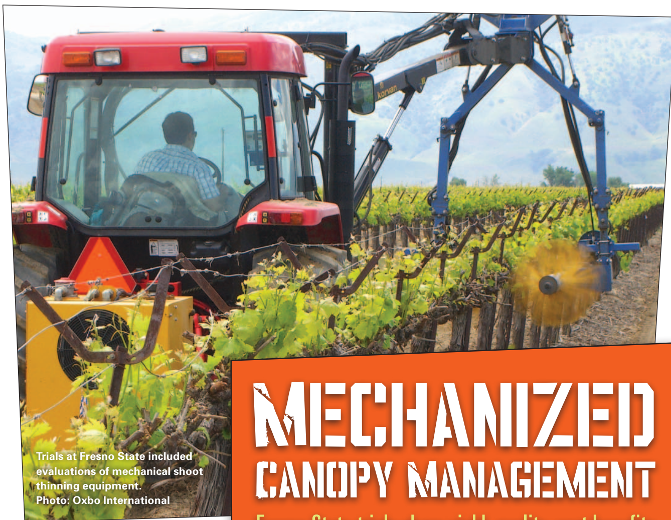
Trials at Fresno State included evaluations of mechanical shoot thinning equipment.