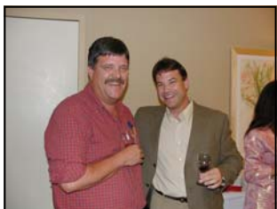
Alumni & Friends at the 2005 Reunion in Seattle

Before dinner on June 28, stop by our Hyatt suite and