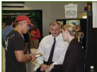
Students meet employers at our annual Career Fair

February 7 — Viticulture & Enology Career Day—Job fair for the grape and wine industry—Fresno State.