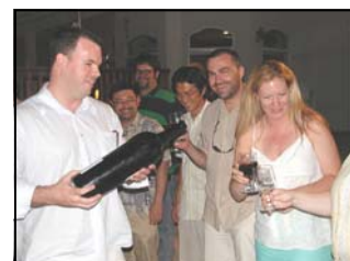
The Class of 2006 shares a special toast at the May 18 dinner!