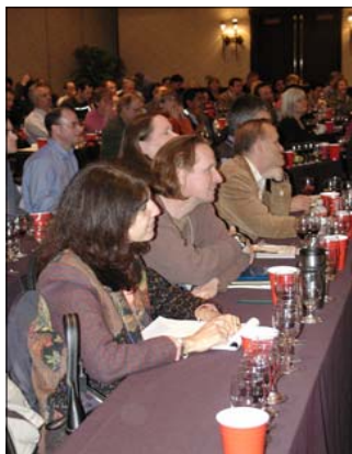
Attendees learn from the world's leading experts on wine microbiology in April 2006

"We worked hard to maintain a balance on the program that represented yeast producers, service industries, researchers, and winemakers."