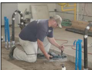
Making progress in May 2006

What's that sound? As you enter the Enology building, you may hear the sounds of construction crews working to complete the enology