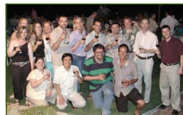
Members of our Class of 2006 at the annual celebratory dinner on May 18 with families and friends