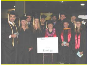
Graduates at the 2006 Convocation