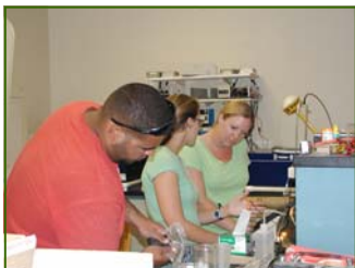
Students enhance their education by getting involved in hands-on research projects

The Department of Viticulture and Enology is pleased to announce that a new certificate program in sustainable viticulture has received university approval. In the