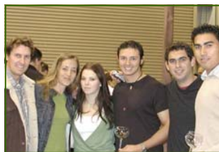
Student volunteers help with various events and activities

http://cast.csufresno.edu/ve http://cati.csufresno.edu/verc http://petruccilibrary.csufresno.edu www.FresnoStateWinery.com www.viticultureenologyalumni.com