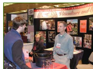
We promote our research and academic programs at various events throughout the year.