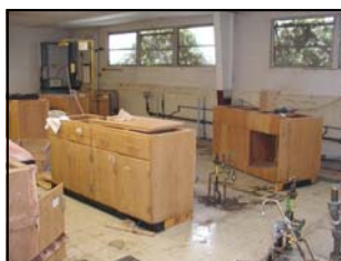
Demolition of the Enology Lab began in the Fall of 2005