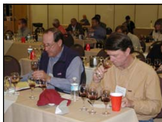
Grape growers and winemakers at the 2006 Central Coast Conference

February 2007 —TBA - 10th Annual Central Coast Viticulture and Enology Issues Conference—Two-day conference for growers & winemakers.