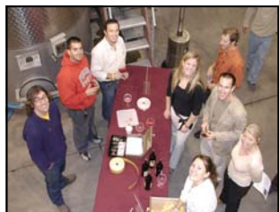
Students educate the community about wine at our annual Le Vin Nouveau and Vino Italiano events

November 9, 2006 —Central Coast Grape Expo - Paso Robles.