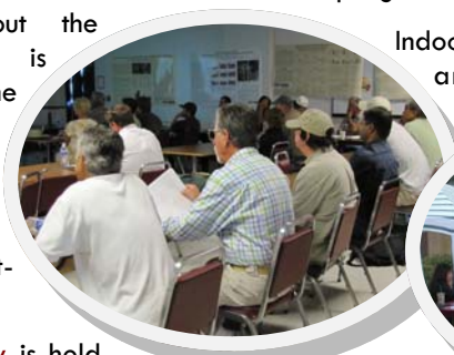
Indoor, and vineyard poster

Grape Day is held every other year on campus and is designed to disseminate information to the grape and wine industry and to showcase the viticulture and enology research and educational programs.