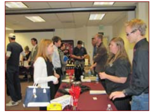
Viticulture and Enology students meet with employers at our Career Fair to learn about future employment and internship opportunities in the grape and wine industry

Sign up today! We believe employers will be impressed with the students and the viticulture and enology program at Fresno State!