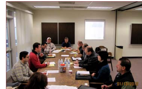
Industry and faculty come together to discuss the campus vineyard earlier this month January 2012