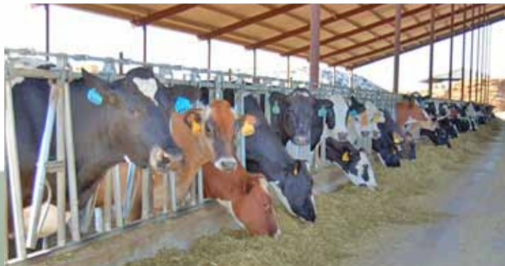
Dairy study of canola meal as a supplement to conventional feed showed an increase in selenium levels in cow blood and milk -- within safety standards.

For more information on this research, contact Banuelos at gary.banuelos@ars.usda.gov .