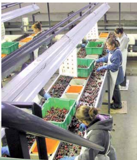
Fruit processing requires regular cleaning of belts and other machinery.

The project includes two phases: One is to work with an area cleaning product manufacturer to develop “green” chemicals that will clean effectively but reduce salinity discharge. The second phase is to try new mechanical processes that will accomplish the same result.