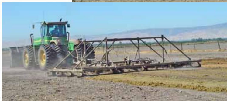
Food processing by-product is dumped onto agricultural fields and spread out to dry before it is disked into the soil.