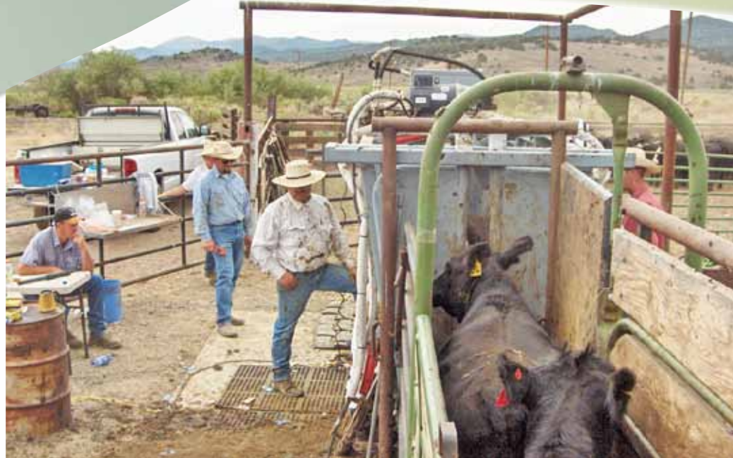
Employees of a cooperating industry partner in eastern California team up with Chico State College of Agriculture staff to perform Hereford heifer pregnancy checks during the course of the study.