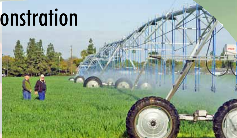
CIT agricultural engineer Ed Norum (left) and mechanized agriculture professor Ken Heupel monitor progress of the new center pivot system installed on the university farm.

In the center pivot system, the unit operates from a pivot point in a field. A galvanized steel framework lined with hanging sprinklers rotates around the center pivot; drive wheels which move the frame are powered by electric motors. A main pipe attached to the center pivot carries the water under pressure to the sprinklers. The water can come from a well on site, a reservoir, or other source. A single pivot system can