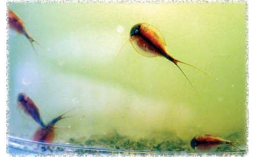
The tadpole shrimp is a freshwater crustacean that damages rice by consuming the planted seedlings.

In an attempt to increase the shelf life of the MF pellets, Tsukimura