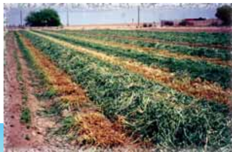
Above: Cut grass is ready for baling.