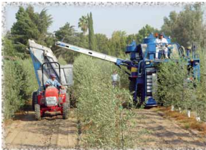
Left: A converted grape harvester machine picks olives on a 20-acre experimental plot on Fresno State's university farm