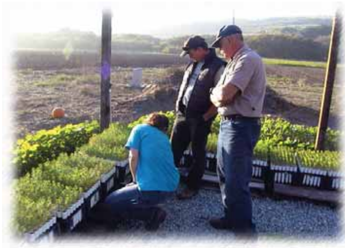
Research team members inspect Monterey Pine seedlings that will be planted in forest stands.