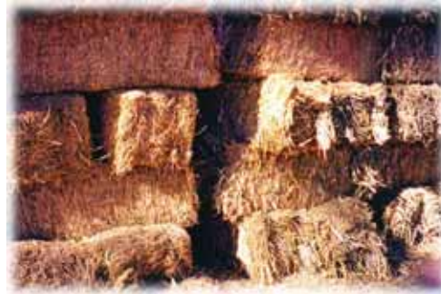
Baled elephant grass is ready to supplement traditional alfalfa forage mix.

"Our goal is to develop a fully-mechanized system that will include a stalk cutter and an auto planter," Rothberg said. Initial trials with the billet cutter will be conducted in Brazil, while Rothberg is pursuing additional grant funds and industry support to