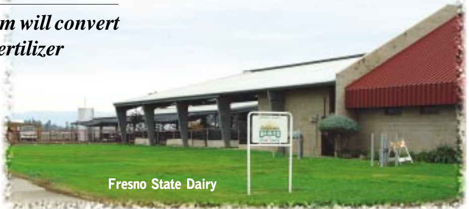
Fresno State Dairy

Based in New York, Bion is a full service waste management company serving the livestock industry since 1989. Among the company's service products is its patented NMS® technology to convert animal waste into nutrient rich fertilizer. All steps in the process are monitored and controlled by state-of-the-art information systems which precisely track the fate of all nutrient elements and air emissions.