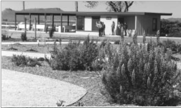
The Friant demonstration garden features an indoor classroom and meeting room complete with maps and photographs of the area.

October 8 – Winterizing Irrigation Systems , from 8 to 9:30 a.m. For irrigation system managers. Presenters will discuss flushing, disinfection, component removal and storage, and protection from freezing, pest damage, storm damage, theft and vandalism, and the environment. No fee. Continental breakfast will be served.