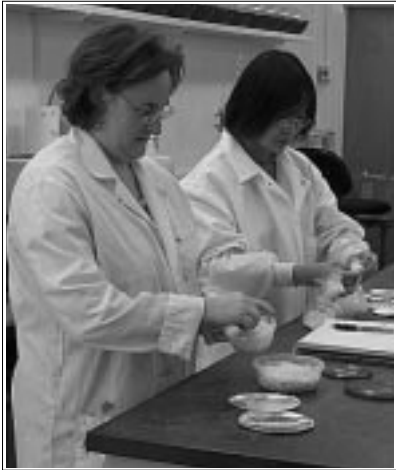
Student technicians prepare food samples for treatment at Fresno State Food Science Laboratory.

Ozone, or O_3 , is a form of oxygen that has proved effective in destroying microorganisms. While it has been used for years as a disinfectant in many industries, its use has been limited in food processing. That changed in 1997,