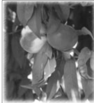
Studies have shown reduced-risk oils to be effective in controlling low to moderate infestations of San Jose scale and peach twig borer.