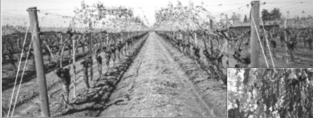
Photo at left, taken in spring, shows raised overhead trellis system directing canes across row middle. Photo below shows raisins ready for harvest.